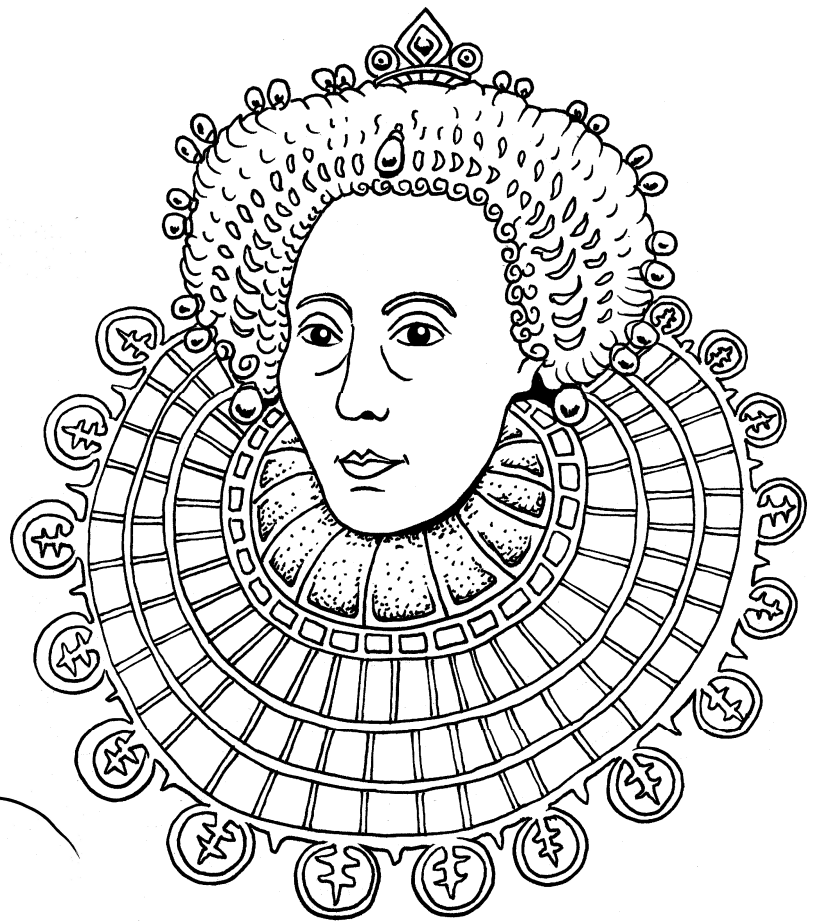
Queen Elizabeth I

Isn't history interesting? To learn more about this go to: